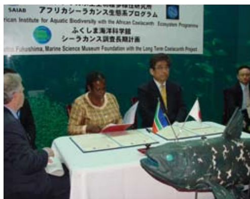
Cooperation with African Coelacanth Ecosystem Programme (ACEP)