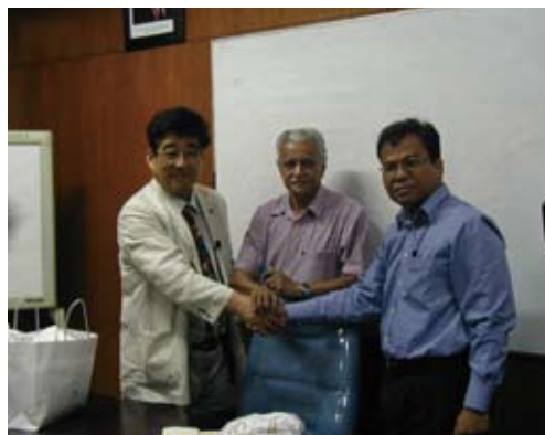
Cooperation with Indonesian Institute of Science (LIPI)