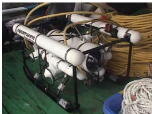
ROV (Remotely Operated Vehicle) is controlled on the boat and capable dive 300 m deep.

Meanwhile, Gombessa, African Coelacanth, Latimeria chalumnae were found along the east coast of South Africa extending Tanzania and off Madagascar. Range of distribution of the Raja Laut, Indonesian Coelacanth Latimeria menadoensis is enlarging in the seas of Indo-Western Pacific? Where is the boundary of distribution for both species? African Coelacanth is known given birth about 30cm juveniles. However, habitat of the juvenile and their life cycle has not known. Moreover, very little is known on the Indonesian Coelacanth. Mysteries are deepening fathom by fathom.